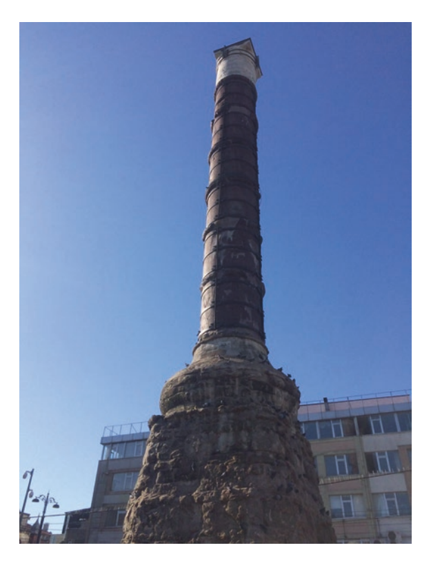
Fig. 3.1 Constantinople (Istanbul), Column of Constantine (early fourth century)

More important for the purpose of this section is the fact that Constantinople was actually regarded as a model for structuring and shaping local urban landscapes. Indeed, "urban sites could be Constantinople in miniature: [...] links with Constantinople [...] all imbricated in the physical fabric and the living present of surviving [...] cities, ended in